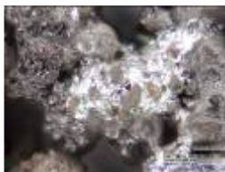
Figure 4. Regolith trapped in Al (Alloy Mixture)

In order to validate the ability to process in situ materials, MSFC has invested in the development of material certification using aluminum in the EBM process. Aluminum can be extracted from the regolith and used in situ. Initially, aluminum powder or other types of metallic powder could be provisioned in case the infrastructure is not established to make in situ aluminum or other materials on the lunar surface. It will be important to prove the EBM process functions properly in the lunar environment and can fabricate parts using these materials. Marshall Space Flight Center (MSFC) has initially worked with titanium as the primary material for the system. As a result, the process has been optimized and proven to be a viable material feedstock with the EBM hardware. Aluminum has also been used in the EBM, but the process has not yet been optimized to the point of producing end-use parts. MSFC will continue to optimize the aluminum process and make it a viable material for EBM processing. Aluminum and titanium are materials that are currently in demand in the aerospace industry. More interest is evolving in using these materials with EBM technology. The medical industry is another example of a group that has invested much time and money implementing the EBM process into their manufacturing capabilities. The use of this