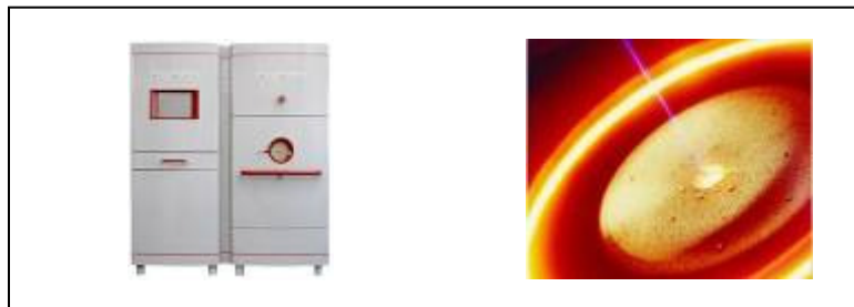
Figure 2. The Arcam S12 EBM Machine and the Electron Beam Material Interaction

The new trade study, based on the ability to fabricate a suite of metal materials, also considered other factors such as accuracy, surface finish, and material properties. Upon weighing all criteria, the Arcam EBM process was selected as the fabrication technology to pursue. The ability of the EBM hardware to process a wide range of materials, such as stainless steel, titanium, copper, aluminum, inconels, and others, was a deciding factor. Additionally, the electron beam melts the metal powder sufficiently to fabricate a fully dense part. The material properties documented in the literature exceeded those of cast material and were in line with wrought properties. The microscopy reported reflected good grain structure. and fatigue data was promising. Based on this data, MSFC invested in the acquisition of a machine (see Figure 2) in order to develop the technology for in situ manufacturing as well as nearer-term ground and flight applications.