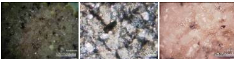
Figure 3. Sintered Lunar Regolith Simulant

The lunar regolith contains metals such as aluminum, titanium, and iron that can be mined and extracted. Another viable feedstock is to use the raw regolith without any beneficiation. Preference would be to use the regolith as is for fabrication feedstock; however, more research must be done to determine if this is feasible. Early results show that the regolith will melt using the EBM process (see Figure 3), but analysis still needs to determine just how strong this fabricated material is after processing. MSFC is currently performing this work and will report the results as they become available. It is believed that the raw regolith will require a binder material in order to get the best possible melt and strength properties. Pure aluminum powder has been alloyed with the raw regolith (JSC-1A and LHT-2C simulants are currently being used in lieu of regolith for this investigation). Some of this material has been processed as shown below in Figure 4. Machine setting parameters such as current and voltage are being optimized while work continues to achieve the best method to alloy these materials.