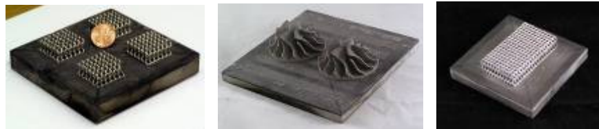
Figure 5. Aluminum Alloys Fabricated Using the EBM Process (Fabricated at North Carolina State University (NCSU))

technology will provide credibility to the process and help gain acceptance as a viable manufacturing resource for in situ fabrication. With this in mind, MSFC is currently involved in the certification of the EBM process using specific materials in order to manufacture flight-qualified hardware. The EBM process can provide significant manufacturing capability to current MSFC programs as well as all manufacturing industries. As this technology evolves and gains acceptance, it will become a more mature technology for in situ fabrication.